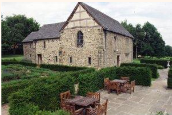
Donington le Heath Manor House

This Christmas you'll find hundreds of great gift ideas in local museum shops and at special shopping events in the run up to the festive season