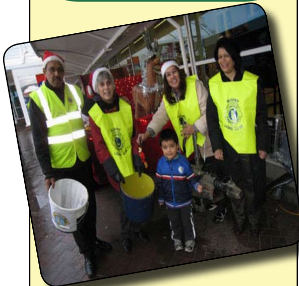
Volunteer collectors outside Tesco Hamilton

Each Year Bushby Lions raise funds during Christmas Week for various charities. This year funds were raised for Children's Groups.