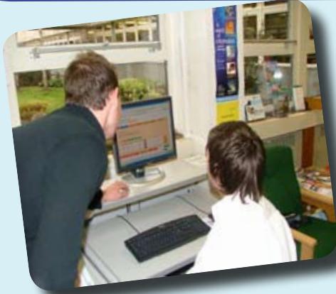
Library users try out the new features

A makeover for transport website 'Traveline' will make finding up-to-the-minute train and bus information easier.